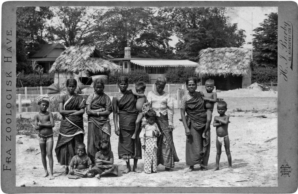
Figure 4.1: A group of Indians, exhibited at the Copenhagen Zoological Garden, 1901. The Indians lived in the small huts, shown in the background of the picture, in the middle of the Zoo.

What if students were to discuss how knowledge of a colonial past might directly and indirectly influence contemporary debates about multiculturalism, language and national self-understandings? Would this challenge the status quo of society and debates in Danish politics?