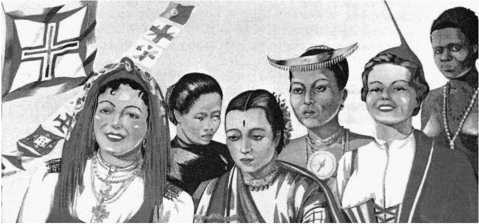
Figure 5.2: Illustration from the Estado Novo school textbook for the 4th grade, 1965

the idea of a unified Portugal, both in the metropolis and in the colonies, as we can see in the example of the illustration above (see Figure 5.2).