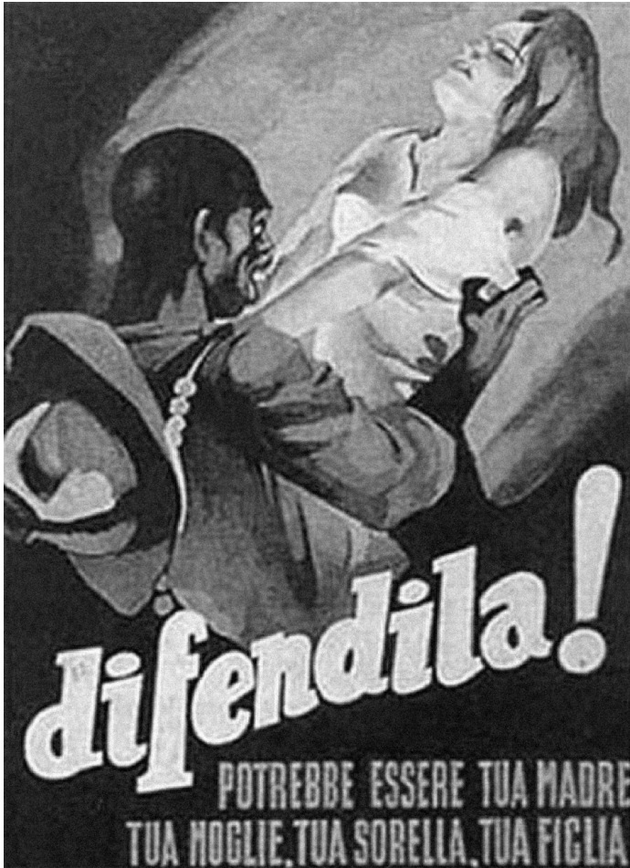
Figure 8.1: Propaganda poster, Italian Social Republic, 1944

The text says: “Defend her! She could be your mother, your wife, your sister, your daughter.”