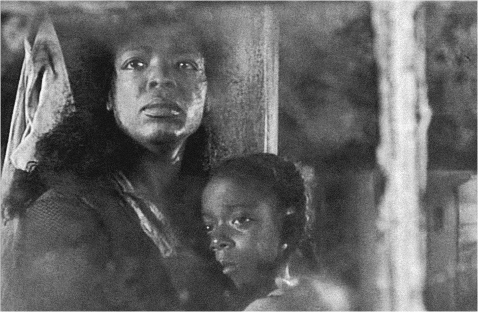
Figure 1.2: Film adaptation starring Oprah Winfrey as Sethe and Kimberly Elise as Denver (Source: still Beloved , directed by Jonathan Demme, USA, 1998, 172 min. Disney Enterprises, Inc.)

too and what is down there. The rest is weather. Not the breath of the disremembered and unaccounted for, but wind in the eaves, or spring ice thawing too quickly. Just weather. Certainly no clamor for a kiss. Beloved .” 14